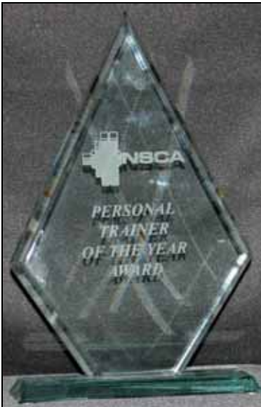
Personal Trainer of the Year is presented for the First time