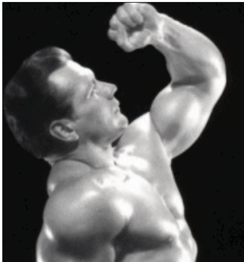
John Grimek – one of the greatest body builders of all-time is presented the Alvin Roy Award

2000, July - The Alvin Roy Award to John Grimek the first Mr. America in 1939 and 1940. John Grimek is the reason the Mr. America title can only be won once now. His physique was so exceptional in an age before steroids they were afraid he would win every year.