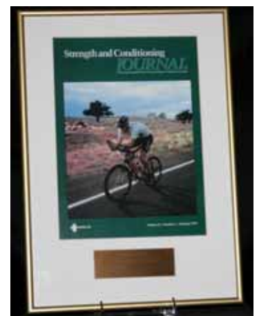
SCJ Editorial Excellence Award is presented for the First time