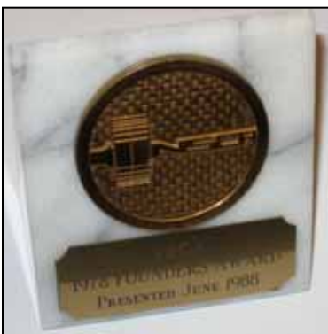
Founders Award presented after ten years