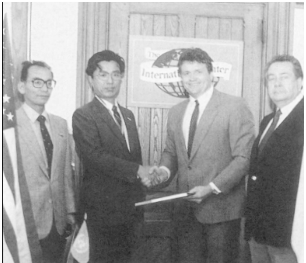
NSCA Japan is formed.