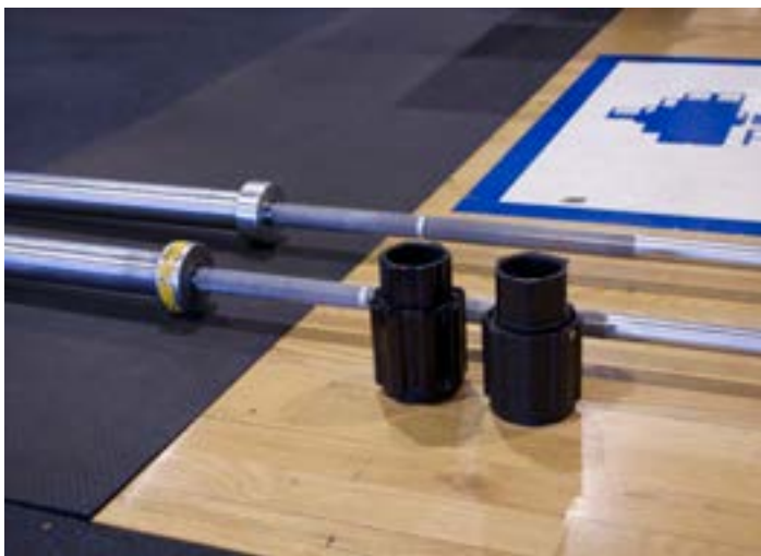
Example of weight bar and collars