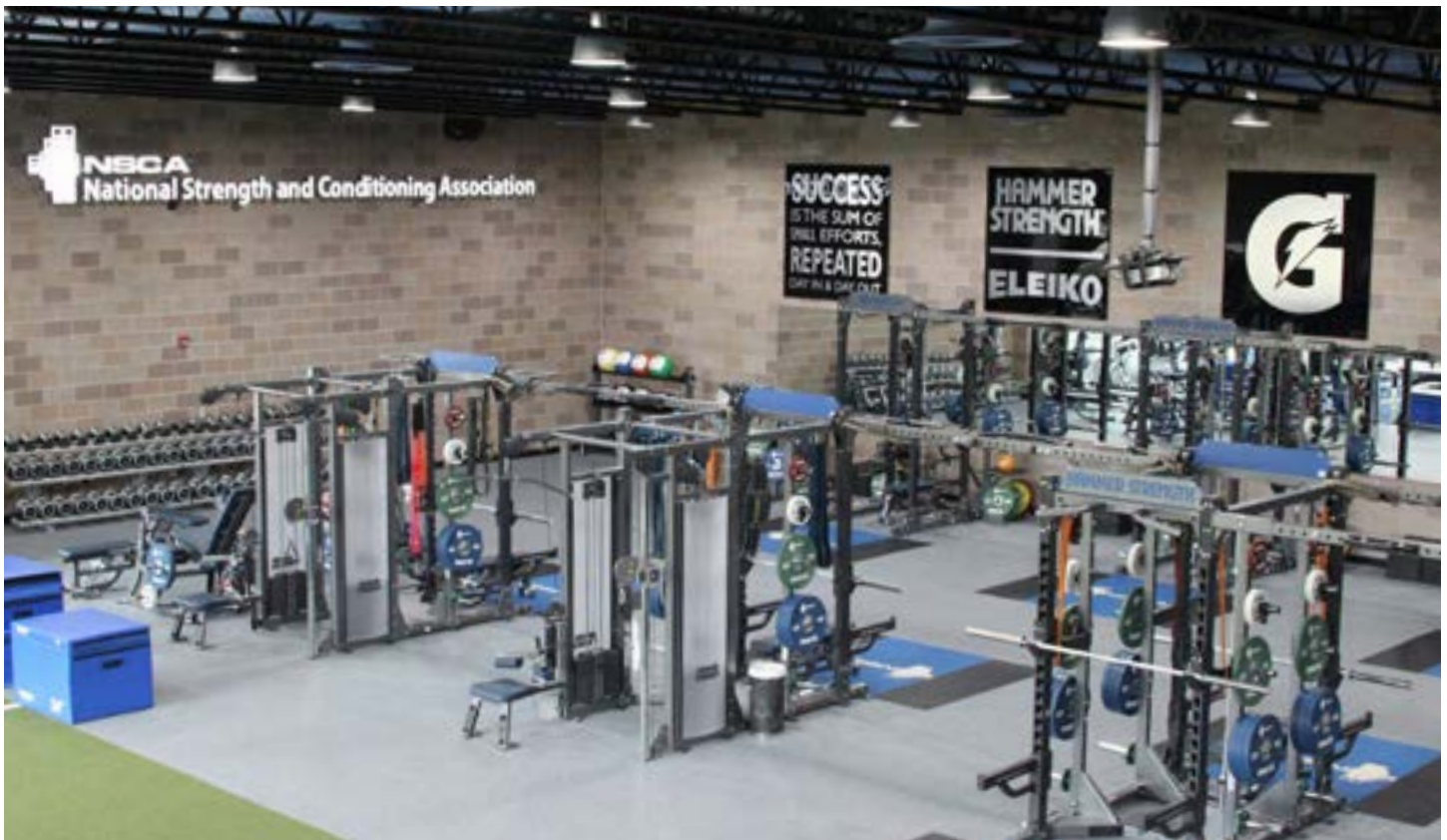
Example of a properly set up weight room