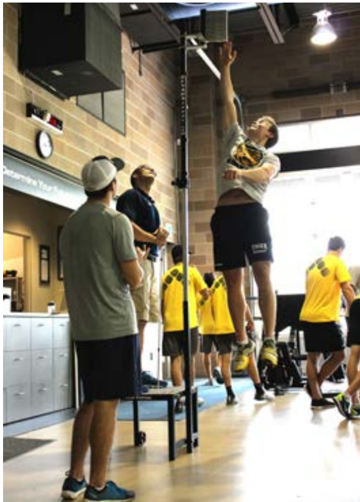
Example of a vertical jump test

Periodization—is a systematic methodology for modifying training variables in order to have the individual peak at the appropriate time and reduce the risk of overtraining.