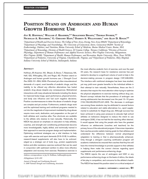
Position Stand on Androgen and Human Growth Hormone Use