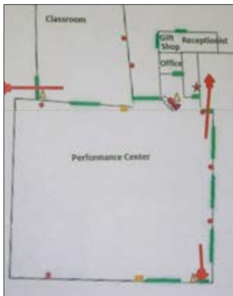
Example emergency evacuation map