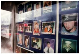
A memorial wall remembering local victims of drug use and drug-related violence in Portsmouth, Ohio, 2012.

BUY BOOK When you purchase an independently reviewed book through our site, we earn an affiliate commission.