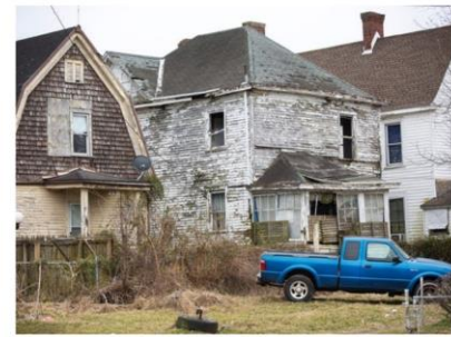
A low income neighborhood in Portsmouth, Ohio. Several of the homes are abandoned and boarded up.