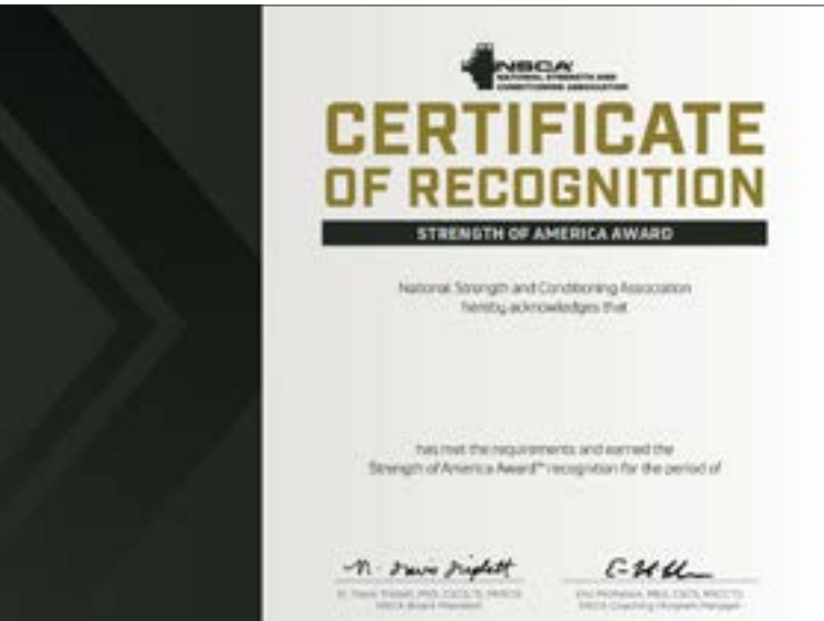
Example of the NSCA Strength of America Award certificate

A Strength of America Award certificate will be presented by the National Strength and Conditioning Association for both the school and the coach.