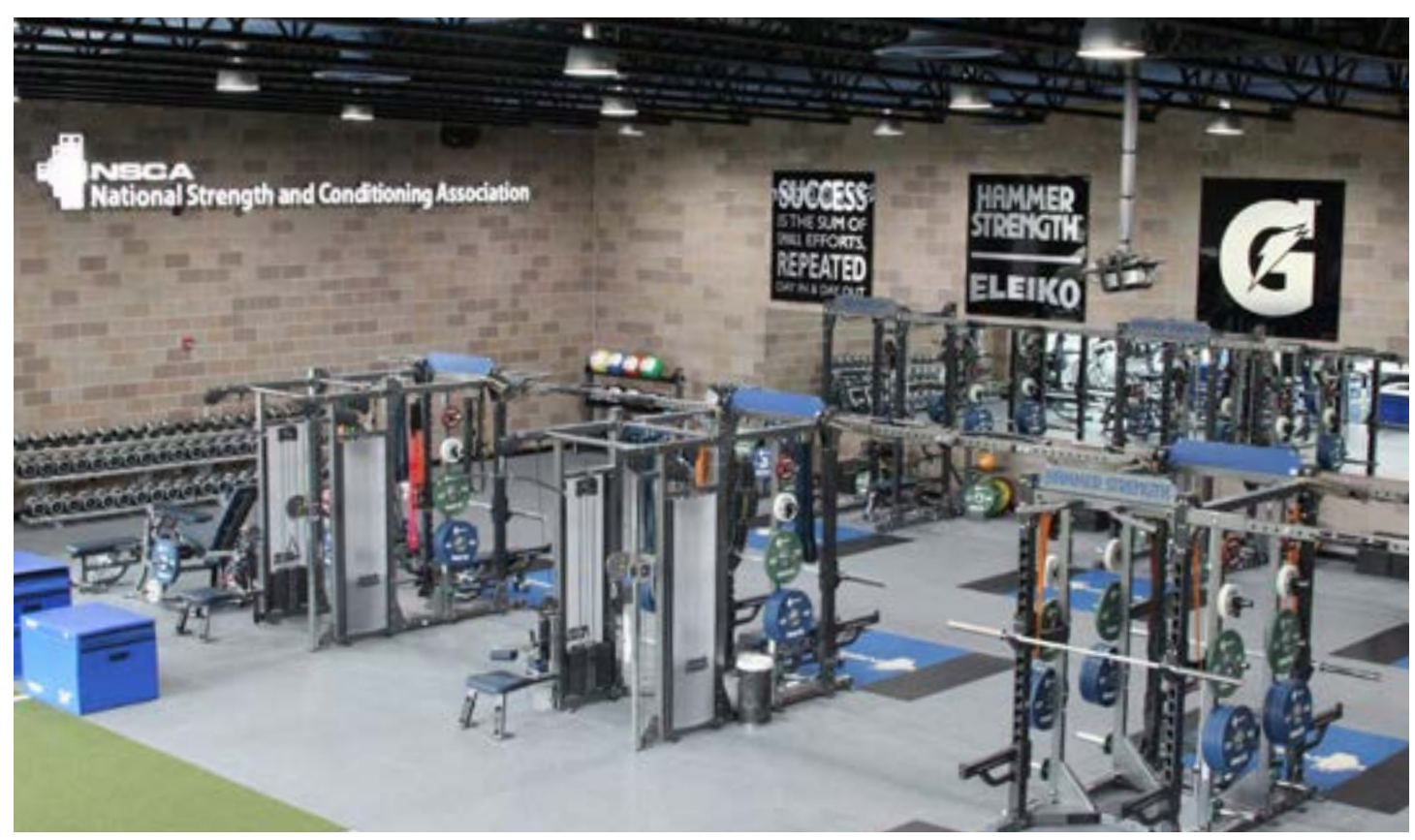
Example of a properly set up weight room