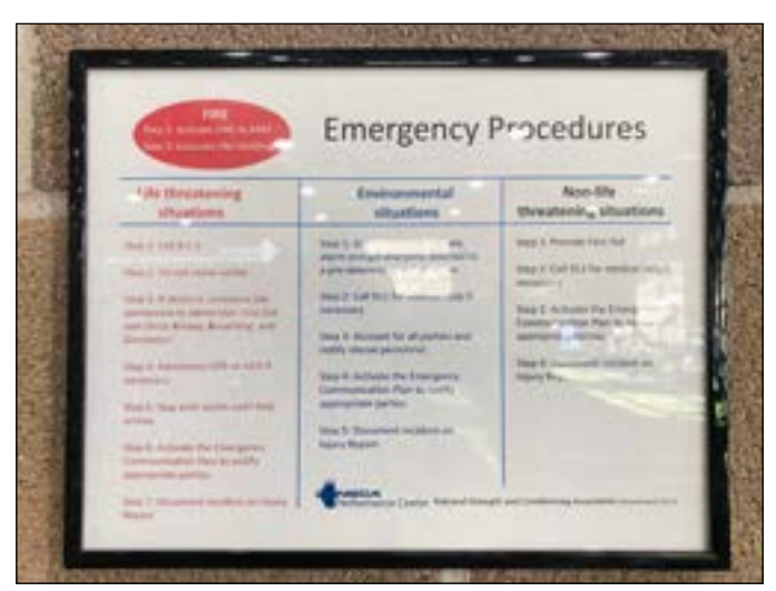
Example of posted emergency procedures