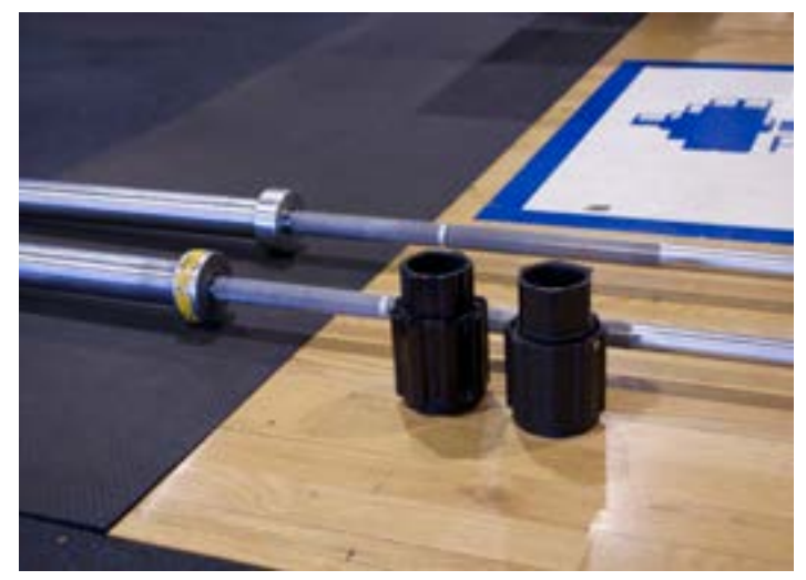
Example of weight bar and collars