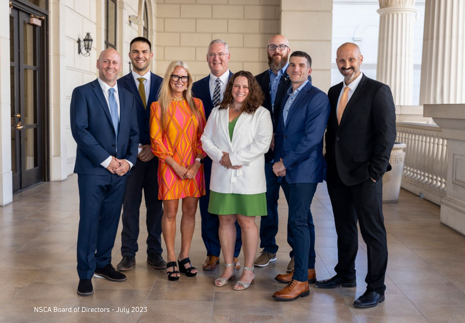
NSCA Board of Directors - July 2023